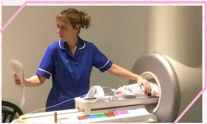
This is one of only two purpose-built neonatal MRI machines in the world

"MRI is able to show all of the brain and the surrounding anatomy, making the images easier to explain to parents. "From a diagnostic point, the big advantage is that MRI is able to show a wider range of brain abnormalities, in particular those which result from a lack of oxygen or blood supply."