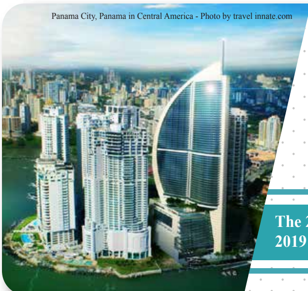
Panama City, Panama in Central America - Photo by travel innate.com

http://www.themalaymailonline.com/features/article/study-too-much-time-with-handheld-devices-causing-speech-delays-in-children#sthash.XUmrDapa.dpuf