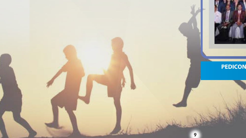
PEDICON 2017 Organizing Committee with CAIP team at valedictory function