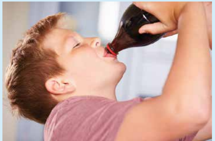
For the most obese children, BMI was found to be 50-60 per cent inherited from their parents.

In China, less than 1 per cent of children and adolescents were obese in 1985. However, obesity levels reached 17 per cent for boys and 9 per cent for girls in 2014, echoing obesity levels in American children aged two to 18 years old (17.4 per cent).